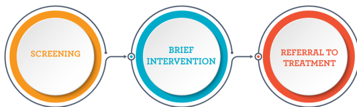
SBIRT: S creening – B rief I ntervention – R eferral to T reatment